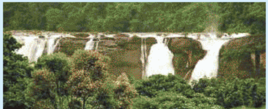
Athirappilly Water Falls

Kerala Backwaters : Backwaters in Kerala are inter-connected freshwater rivers and canals that feed towards the sea. It is a network of channels, lakes, lagoons and deltas of approximately 44 rivers emptying in the Arabian sea. The principal mode of transport on these backwaters is houseboats. A vast network of backwaters in Alappuzha, Kollam, Kottayam, and Ernakulam districts makes Kerala the Venice of East.