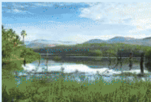
Thattekkad Bird Sanctuary

Natural beauty, clean air and primordial greenery amidst the vast expanse of water and sky, typifies the State of Kerala - better known as God's own country. The enigmatic strip of land is replete with endless miles of placid backwater that adds to its marine beauty. The slopes of the Western Ghats are a perfect rundown of rare flora and fauna and the fragrance of its coffee blossoms waft in the air round the year. If the strain of urban life has your nerves jangling, Kerala will help you unwind and drain the tension out.